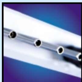
Two-in-one washing tubes