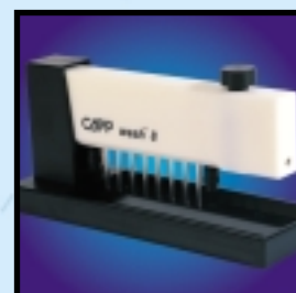
A holder follows with each CappWash