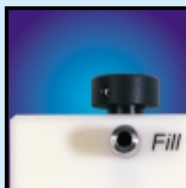
Push the button to fill - release to empty