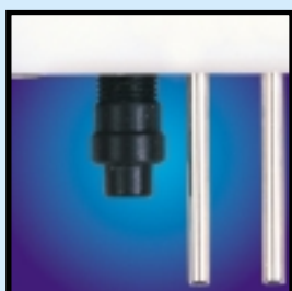
Screws for easy well-depth adjustment